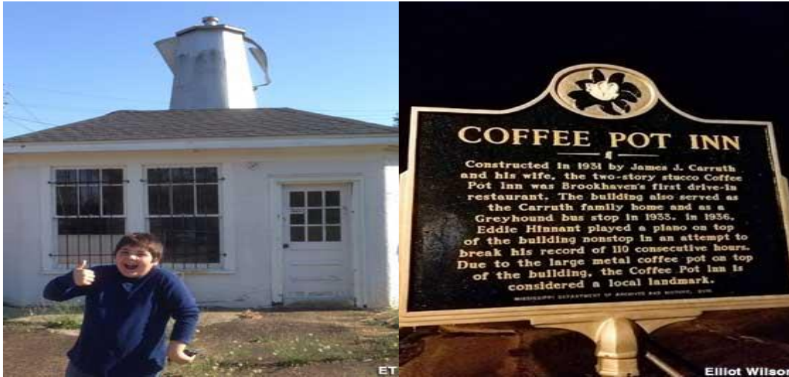
Photo of the Coffee Pot Inn building itself or Plaque, and your placard is good documentation, you may not be able to illuminate the actual Coffee Pot on the top of the building because it will be dark.

Coffee Pot Topped Building A historical marker was added to this site in 2016. It informs us that Eddie Hinnant played a piano on the roof when he tried to break his piano-playing record of 110 continuous hours -- but the sign doesn't say if he succeeded! The marker also clarifies, once and for all, that, yes, this building is a local landmark because there is a coffee pot on top. Who knew?